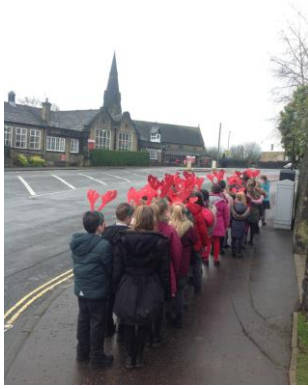
Reindeer Run for Overgate Hospice